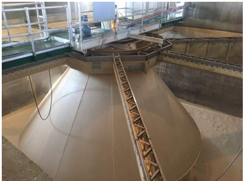
Burr Water Treatment Plant Contact Basin