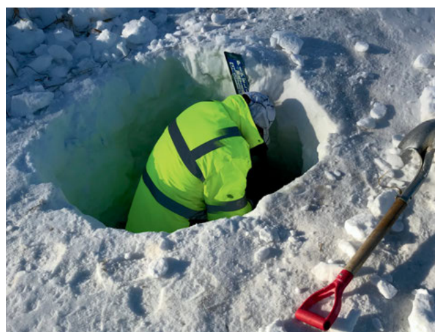
Searching for a service line valve!

Nitrate: Nitrate in drinking water at levels above 10 parts per million is a health risk for infants of less than six months of age. High nitrate levels in drinking water can cause blue baby syndrome. Nitrate levels may rise quickly for short periods of time because of rainfall or agricultural activity. If you are caring for an infant, you should ask advice from your health care provider.