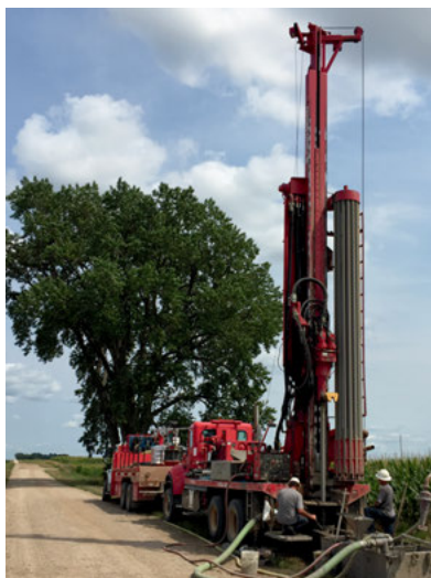
Water exploration near Dawson, MN.