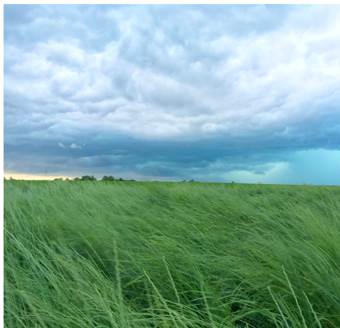
Stormy skies over a Kernza field in Chatfield, MN

Soil water samples were collected from a portion of the city planting, along with grain and biomass yields and data on soil moisture. Nitrate levels in soil water were nearly 0 ppm, indicating that little nitrate was being lost through leaching, and that Kernza production could be a promising option for crop production on vulnerable land.