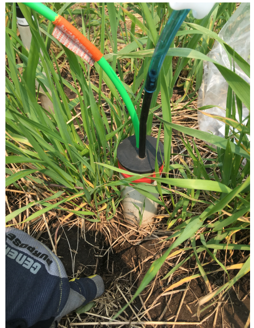
A lysimeter installed in Lincoln-Pipestone

Note: Kernza does need to be fertilized in order produce economically-viable grain yields over the 3 years for which it is typically harvested, but at the time this trial was initiated, more data from plot-based trials was needed to confirm that Kernza planted on Wellhead Protection land could be fertilized without contaminating groundwater. Since the completion of these field trials, a plot experiment in the Central Sand Plains region of Minnesota found that soil water nitrate concentrations remained very low even under Kernza fertilized at 100 kg N/ha (about 90 lbs N/ac). With this new evidence, next steps will include fertilized field trials.